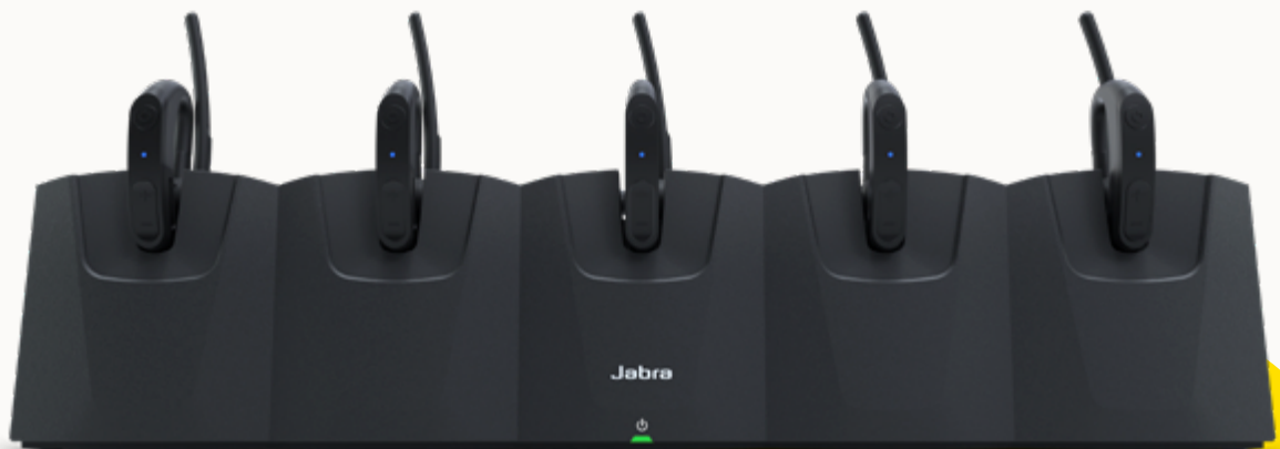
PERFORM CHARGING STAND, 5-BAY**

That's what we call a multi-tasking time-saver.